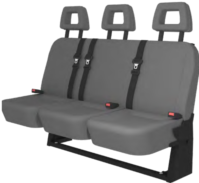
MAXI 3 Seater