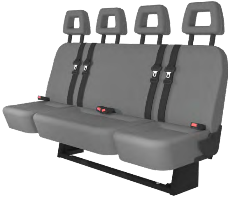
MAXI 4 Seater