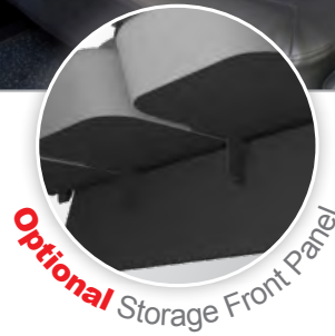
Optional Storage Front Panel