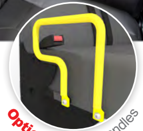
Optional Assist handles